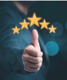
Top 5 Research Notes

Click Here to Recommend Researchers & Topics for Research Notes in 2024